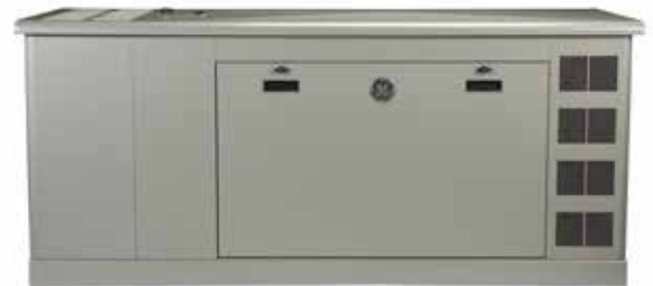
48kW 1 Home Generator System

To learn more, visit www.ge.com/generatorsystems